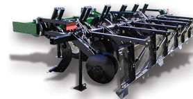
RIPPER BEDDER TILLAGE TOOL

SEE HOW YOU CAN RIP COMPACTION AND CONDITION YOUR SEEDBED.